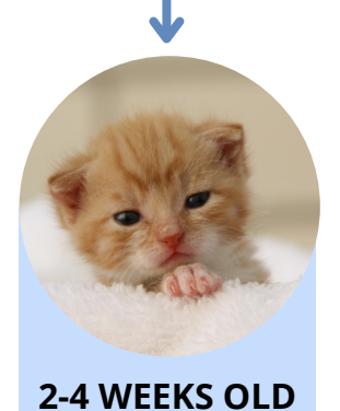
Eyes open and alert; becoming mobile