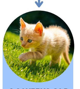
6-8 WEEKS OLD Very active and playful; around 1-2 pounds