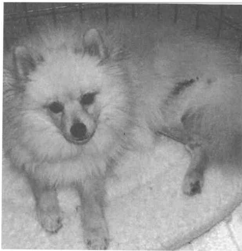
Sarah's Fund provided Poppy with a second chance at a healthy, happy life.

If you are interested in contributing to Sarah's Fund, you can send a gift in the enclosed pre-addressed, postage -paid envelope. Please check the box marked 'Sarah's Fund' on the envelope. Look for more Fund updates in our next newsletter!