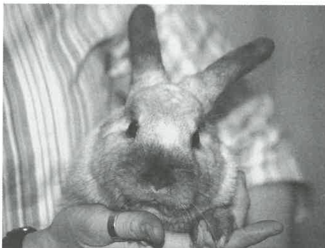
With some attention and a little training, rabbits can be housebroken and make wonderful companions.

of a family whose last rabbit learned to "play" the xylophone, could regularly knock down bowling pins with a ball, and could identify about 60 different commands! One of our staff members has rabbits who come when they are whistled for; another has a rabbit who regularly falls asleep upside-down in her lap and also clears a 4-foot barrier in a single bound.