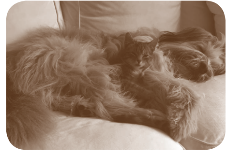
Minnow and Clover cuddle up.