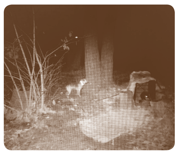
Maizee captured on a wildlife camera set up by AWLA staff

Hubbard was exhausted but gratified after more than two weeks on beagle patrol: "One of the coolest things for me was to see how the staff, volunteers and community all worked together to bring Maizee and her friends home."